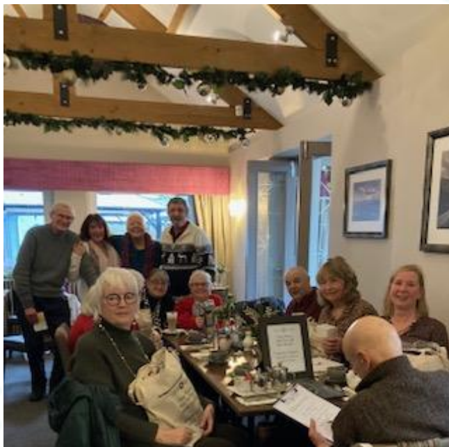
Members of Carmarthenshire Carers Forum at the Plough, Rhosmaen for the launch of 'Stay Warm, Stay Well and Save Energy' December 2023